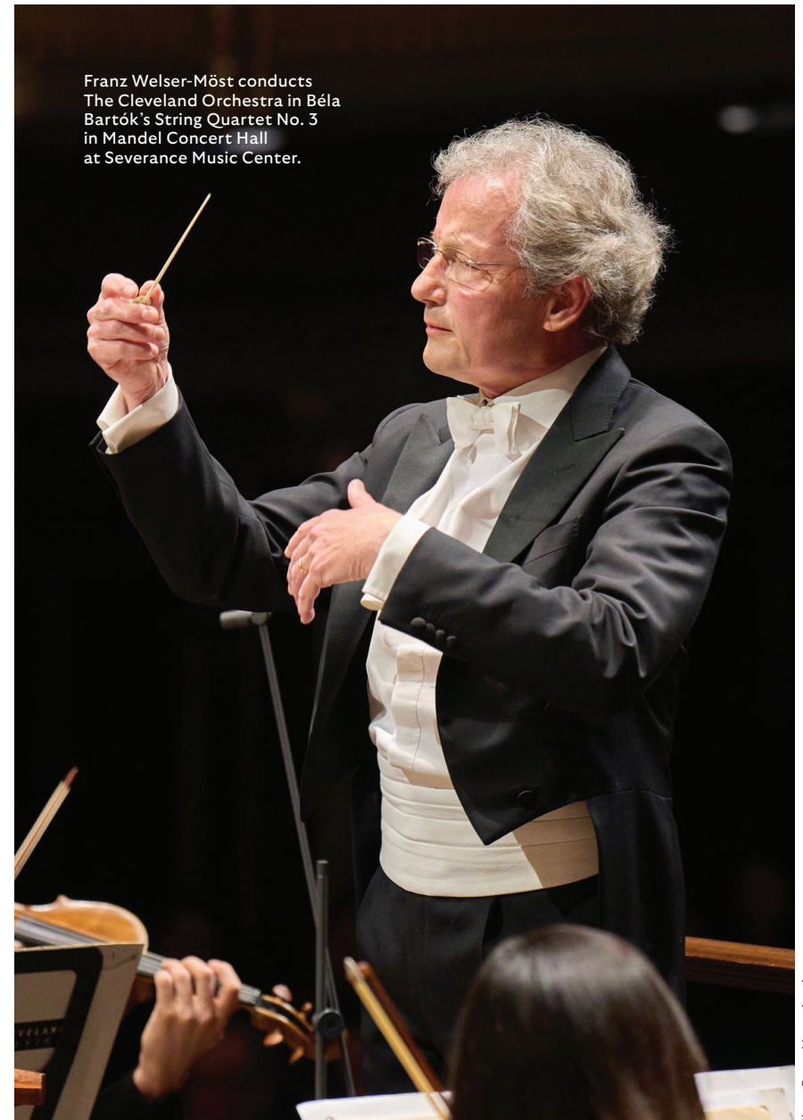
Franz Welser-Möst conducts The Cleveland Orchestra in Béla Bartók's String Quartet No. 3 in Mandel Concert Hall at Severance Music Center.

In 2019, Welser-Möst was awarded the Gold Medal in the Arts by the Kennedy Center International Committee on the Arts. Other honors include The Cleveland Orchestra's Distinguished Service Award, two Cleveland Arts Prize citations, the Vienna Philharmonic's "Ring of Honor," recognition from the Western Law Center for Disability Rights, honorary membership in the Vienna Singverein, appointment as an Academician of the European Academy of Yuste, and the Kilenyi Medal from the Bruckner Society of America. ■